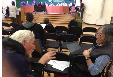
Planning our presentation