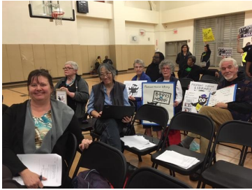
PAL supporters at OUSD