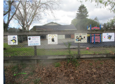
CDC Building with Friends' signs